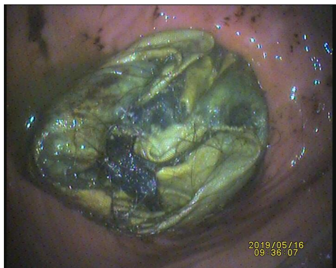
Fabric found within the stomach.