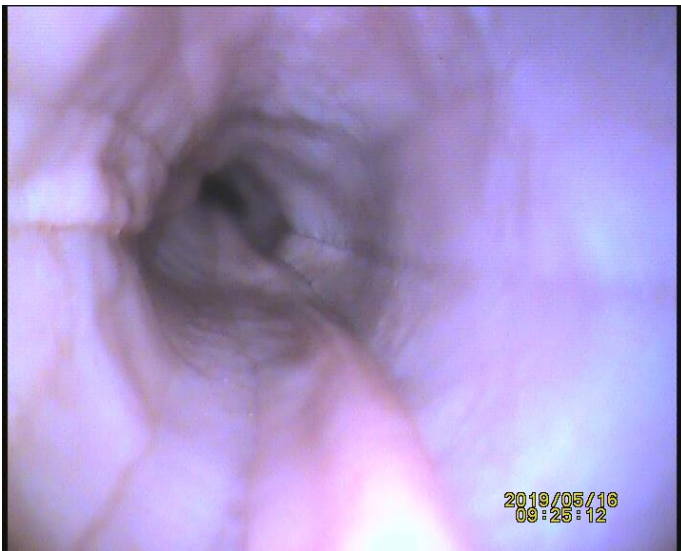
View of the inside of the esophagus.

performing a potentially painful and expensive abdominal surgery, he decided that there might be a chance that he could remove the foreign material under anesthesia with our endoscope (a tubular camera that can visualize the stomach without pain and has a working channel in which to pass instruments down into the stomach). With the assistance of Dr Petersen, the 2 doctors were able to visualize the esophagus and stomach which revealed a piece of colored bedding sheet within the stomach near the entrance into the small intestine. The fabric was removed via special graspers. The procedure was completed within 30 minutes and Tess was able to go home that same day. She recovered quickly and uneventfully. We are so happy to be able to offer endoscope procedures for our patients that, at times, can replace more painful, and expensive procedures, and allow a faster recovery time. Below are some pictures of the endoscopy procedure.