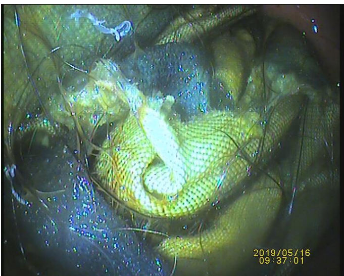
Close up of fabric found within the stomach.