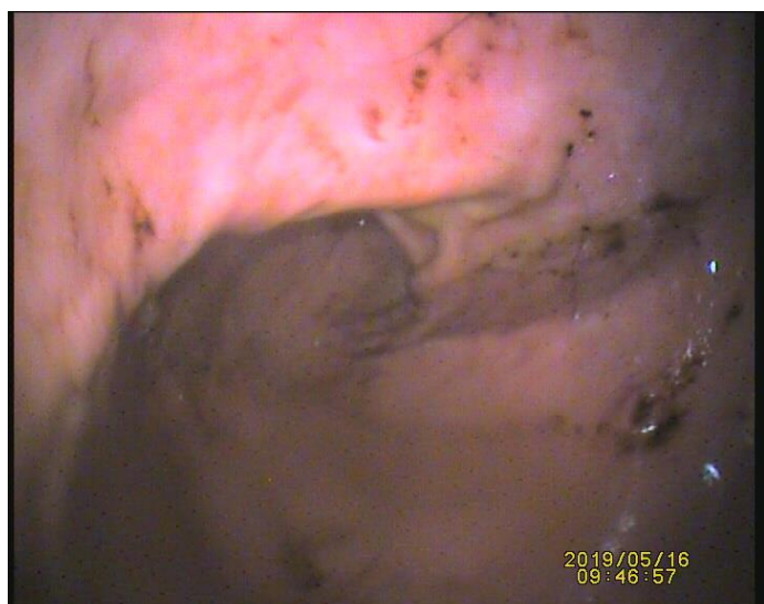
View of the inside of the stomach after the fabric was removed.