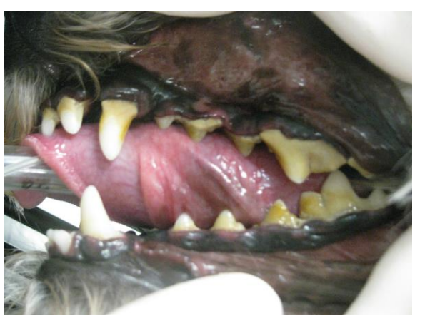
After teeth cleaning