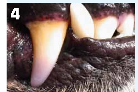
This tooth has purple discoloration at the tip, indicating that the tooth is dead.