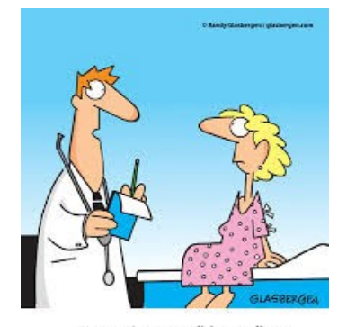
"You need strong medicine to relieve your stress. I'm prescribing a puppy."