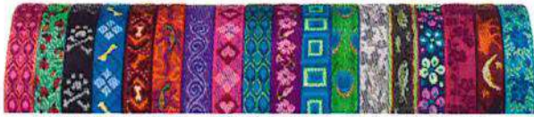
Lupine Pet products available at Cicero Animal Clinic, P.C.

www.ciceroanimalclinic.com www.virbac.com www.vetstreet.com www.heartwormsociety.org www.cupvet.org www.puzzle-maker.com www.lupinepet.com www.akc.org