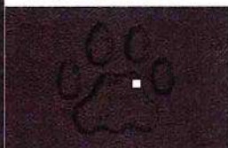
Paw pads should look like this: