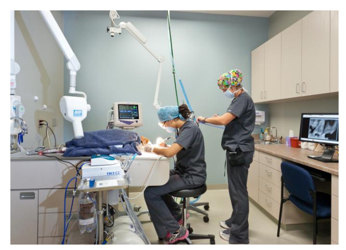
Pet having teeth cleaned and anesthetic monitoring in our dental suite.

4. Intraoral Radiology . We use state-of-the-art digital radiology to analyze the teeth of all patients undergoing a dental procedure. The only way to accurately evaluate the whole tooth is to x-ray. The crown is the only portion of the tooth visible in the mouth; the root of the tooth is embedded in a socket in the jaw bone. In many cases the crown of the tooth may appear normal, but an x-ray of the tooth may reveal a problem with the root that requires treatment. Once all of the teeth in the mouth have been x-rayed, the treating veterinarian reviews the x-rays and determines which therapy is required for each tooth.