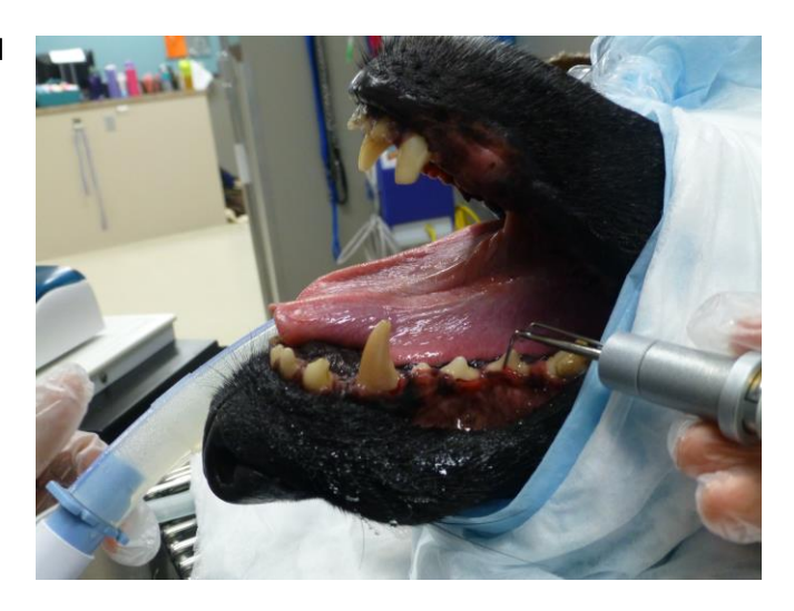
The ultrasonic scaler is being used to remove tartar

5. Scaling . Scaling is the process where the tartar is removed from the teeth. Tartar is produced by bacteria that lives on the teeth. Tartar causes inflammation of the gums (gingivitis) and this leads to recession of the gums, exposure of the tooth roots, and eventually loss of the tooth. We remove the tartar with a combination of an ultrasonic scaler and hand scaling (similar equipment as the human dental hygienists). Removal of the tartar on the teeth is vital to improving the health of the mouth and it also removes one of the sources of the patient's halitosis (bad breath).