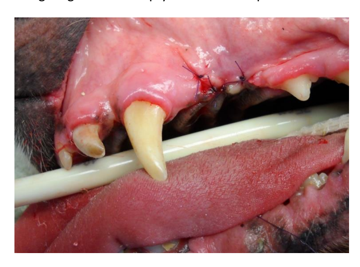
The tooth has been removed and a gingival flap is sutured over the socket.

cleaned. A post extraction x-ray may be necessary to make sure that all of the roots have been removed. Once we have confirmed that there are no tooth root remnants, we close the socket using the gum flap. This prevents food material from becoming lodged in the empty socket. The flap is sutured with a fine absorbable suture.