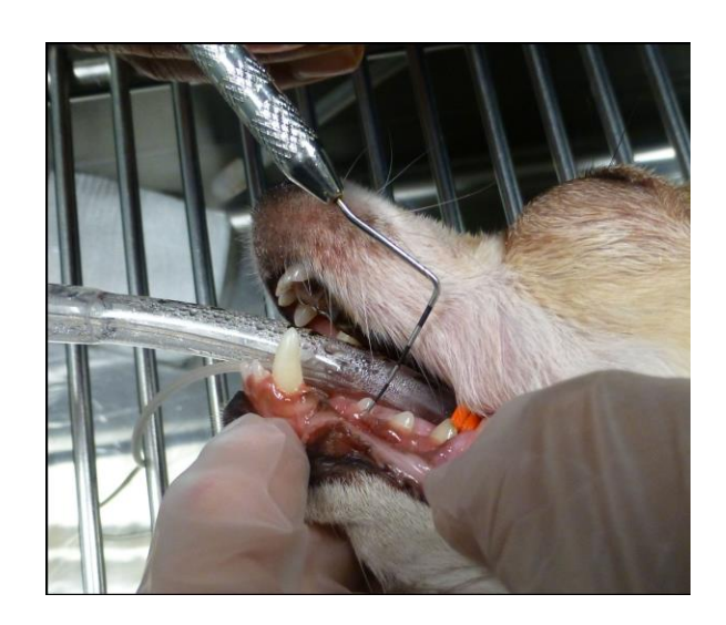
A periodontal probe being used to detect periodontal pockets.