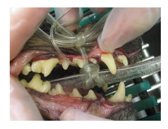
Teeth After Cleaning