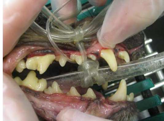
Teeth After Cleaning