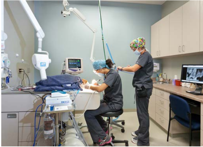
Pet having teeth cleaned and anesthetic monitoring in our dental suite.