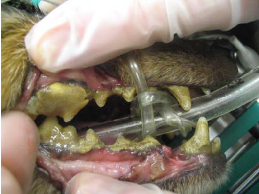
Teeth Before Cleaning

Did you know that 80% of animals over 5 years of age have some form of dental disease? Studies have shown that regular dental cleanings extend pet's lives an average of 2-4 years! Tartar and bacteria in the mouth causes inflammation and damages the attachment of the gums to the teeth. Over time the inflamed gum tissue and infection creates significant pain for your pet. Additionally, this infection can be transported throughout the body most commonly the heart, liver, lungs, kidneys, and spine. At Frey Pet Hospital, we utilize the latest techniques and modern equipment to provide the best dental care for your pet. The following explains exactly what is involved in the dentistry procedure at Frey Pet Hospital.