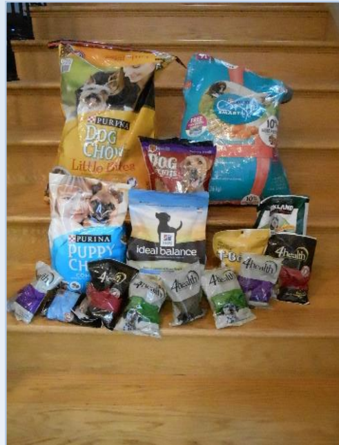
Food Donation for SAAP from the Open House

Riverview Animal Hospital wants to thank everyone that came out for our annual open house. Riverview Rendezvous was our way of giving back to our wonderful clients and helping out the stray animal adoption program (SAAP). With your help we were able to donate $310 to them in addition to food items.